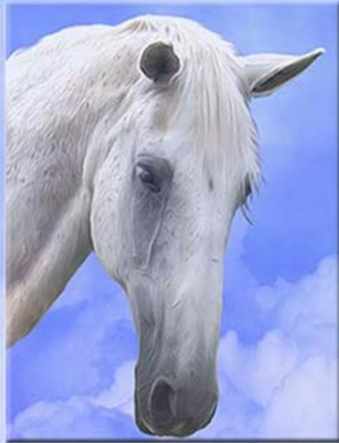
'WOW' 1987 – 2010 My Mentor –Teacher- Best Friend Our Silent Bond is Eternal