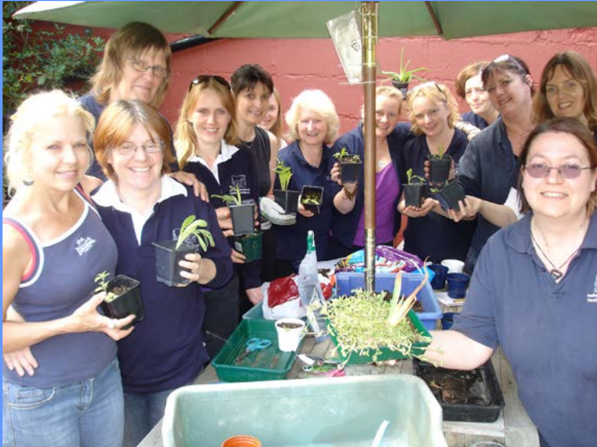
AnimalChoices students at the Practitioner's Course 2011

of natural food oils which can be used by healers and guardians alike. The oils are available online, together with simple instructions. While consulting a professional animal healer is always beneficial, the responsibility is ours to provide healthy nutrition to the animals in our care. AnimalChoices oils are designed to be easy to use, and because they are food substances there is no concern about prescriptions or contraindications. In fact, the animals make the choice. Check out www.animalchoices.co.uk to order your macerated oils and for information on the Practitioner's Course.